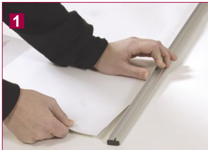
1 Open the top rail and position the graphic banner.