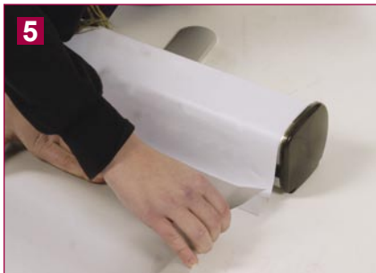
5 Attach the bottom of the graphic banner to the leader strip. Back of graphic attaches to the tape.