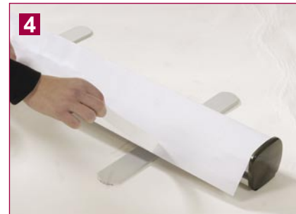
4 Remove the paper backing from the tape on the leader strip.