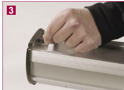
3 Remove the endcap screw (same end as the rubber pin mounts) and remove that endcap from the cassette.