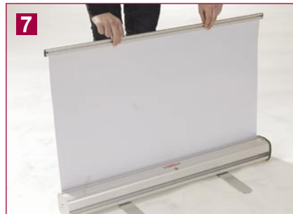
7 Let the banner slowly roll into the cassette.