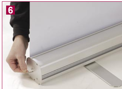
6 Hold the graphic banner firmly and remove the locking pin.